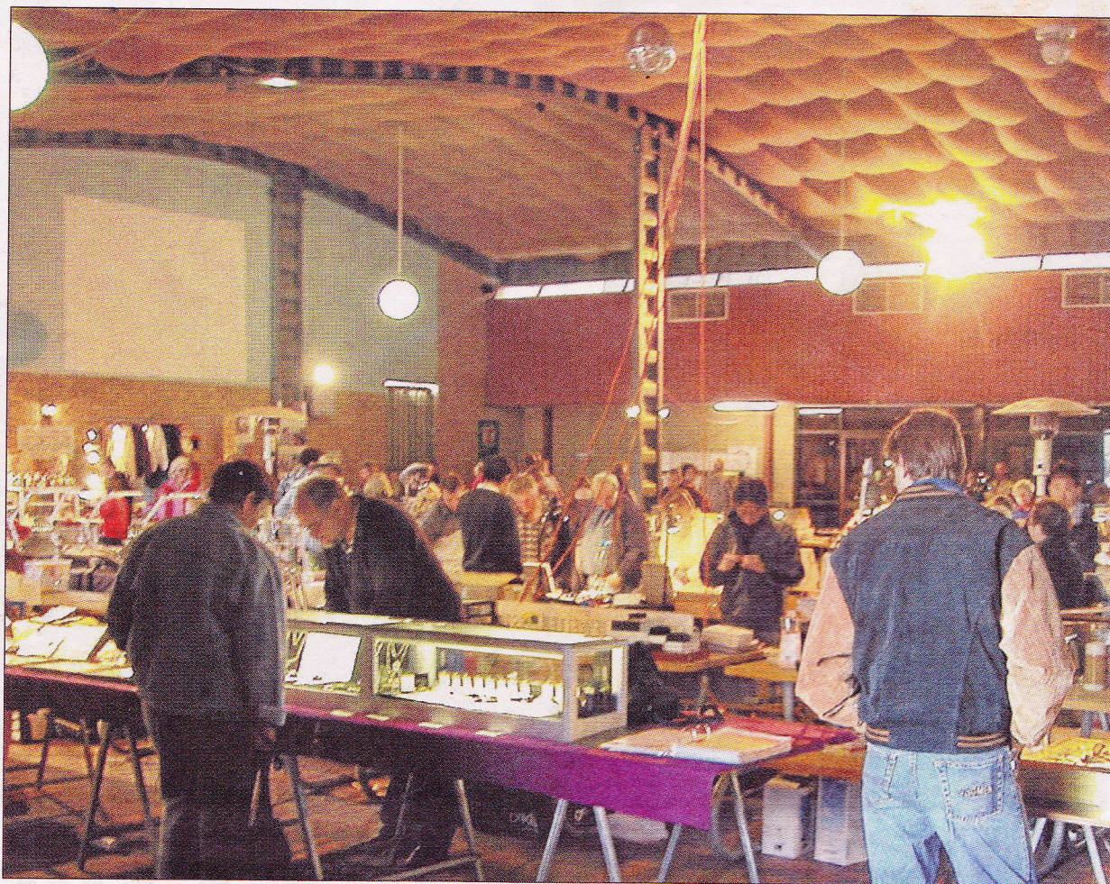
There will be more than 120 stalls inside and outdoors at the Lightning Ridge and District Bowling Club during the annual Opal and Gem Expo.